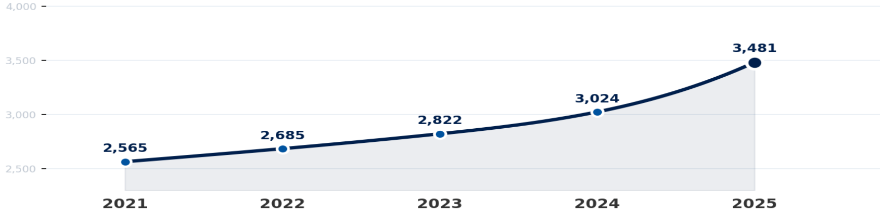
MCRRT Calls Attended — 2021 to 2025