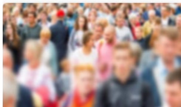
Trauma Informed Approach and Implicit Bias