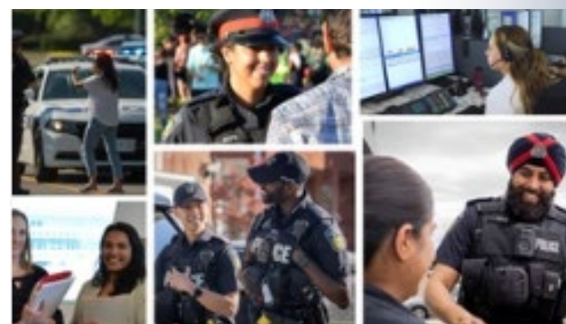
Peer Intervention Training